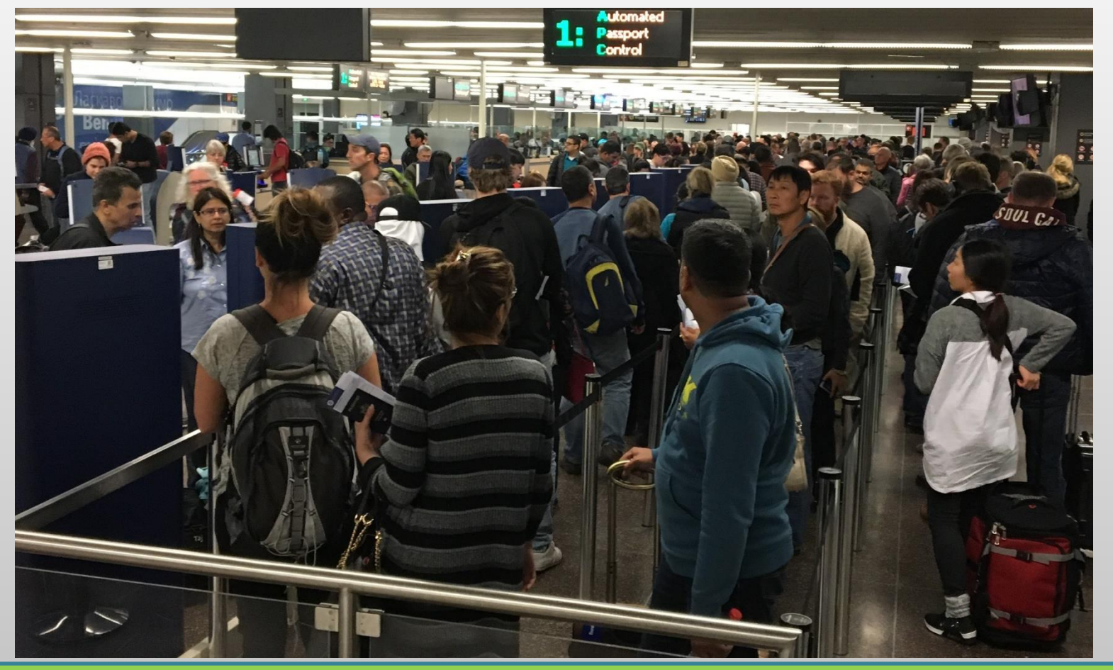
Facility crowding with 26 kiosks